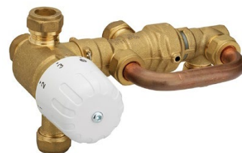
Part No S40000001