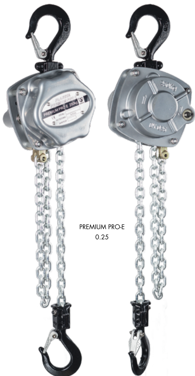
PREMIUM PRO-E 0.25