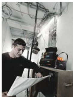
Wera 2go 4 Tool Quiver