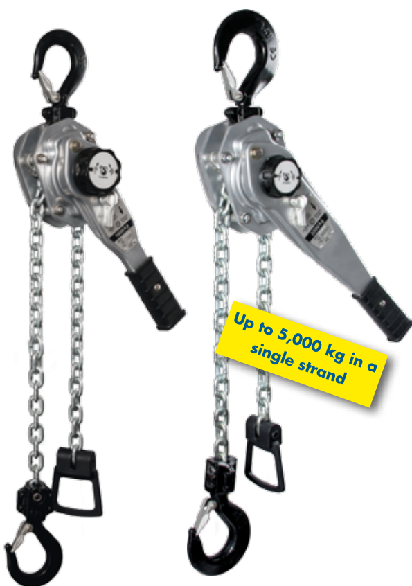
PREMIUM PRO 1.6

Hand lever can be used in any position thanks to the ratchet; safety automatic mechanical brake; galvanised connecting parts; cast hook clip; large, non-slip and closed hand wheel; safety chain end piece.