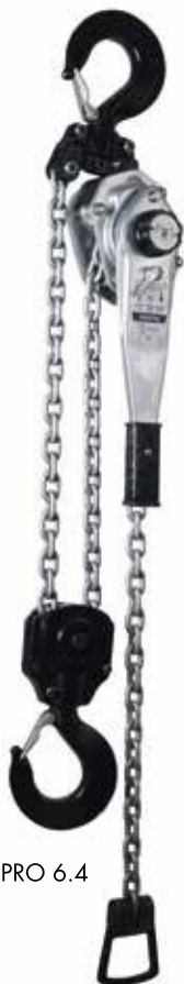
PREMIUM PRO 6.4